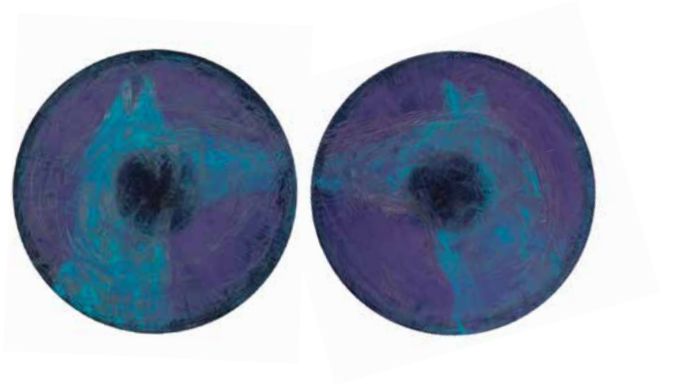
Takipte | In Pursuit Tuval üzeri yağlıboya | Oil on canvas