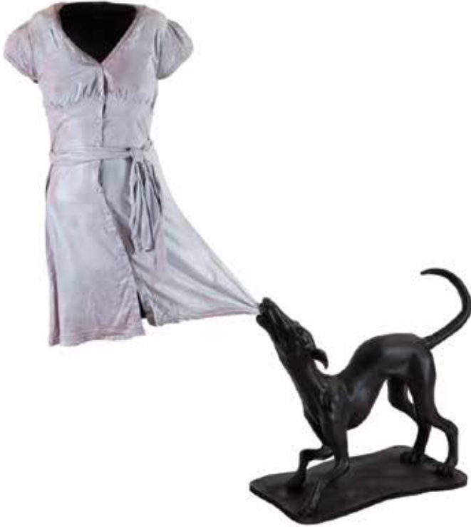
İsimsiz | Untitled Polyester | Polyester