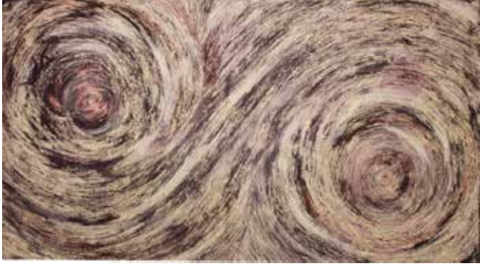
Athene Noctua | Athene Noctua Tuval üzeri yağlıboya | Oil on canvas