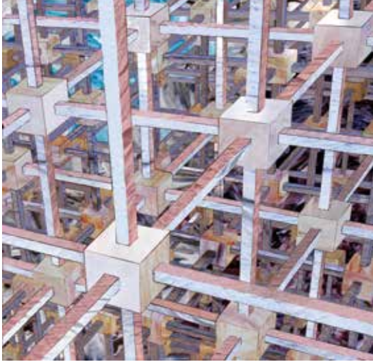
Post Kbik Mekan Blmlemesi | Post Cubic Space Division Kontırplak zerine cam ve ayna | Glass on plywood and mirror